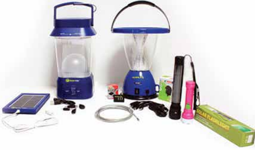
Solar Laps and Equipment Solar Lamba ve Aletleri