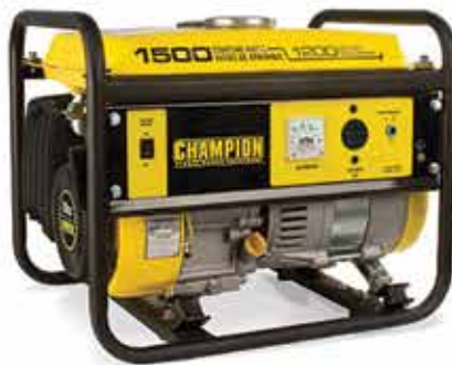
Pumb / Genarator