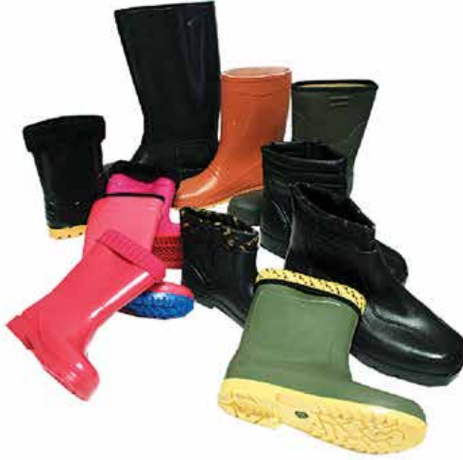
Shoes / Ayakkabı