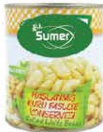
Canned White Bean