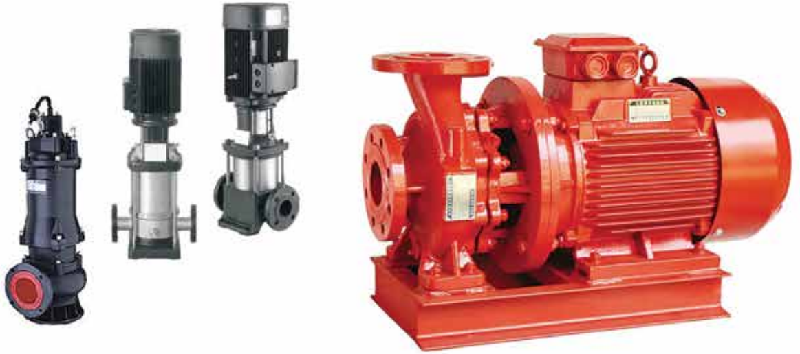
Pumb / Genarator