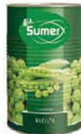
Canned Green Pea