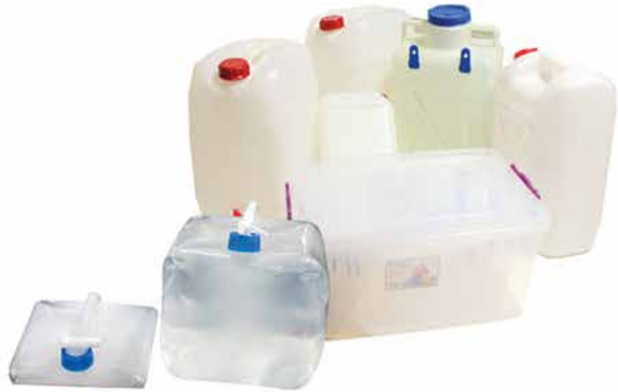
Wash Programme Bidonlar