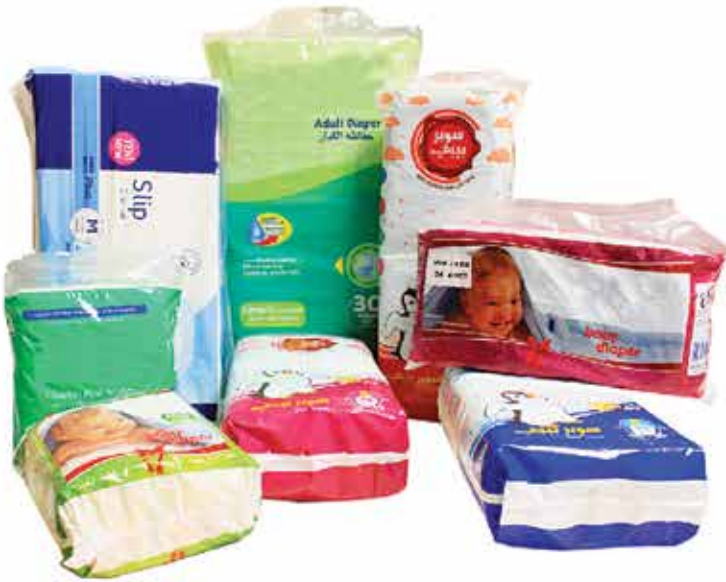
Baby and Adult Diaper Bebek ve Yetişkin Bezleri