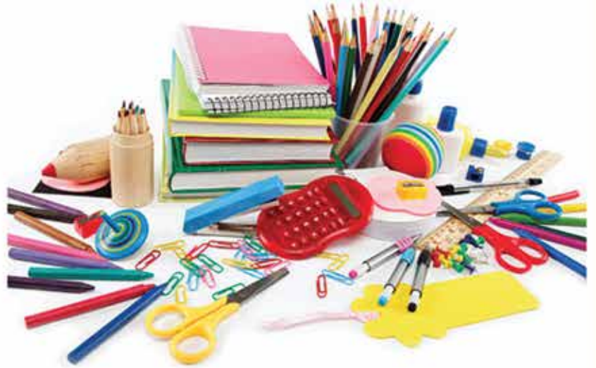
School Equipments Okul Araç Gereçleri