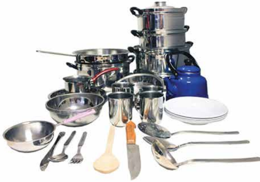
Kitchen Kits / Mutfak Setleri