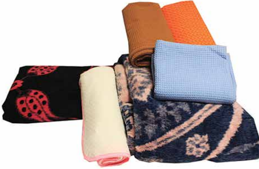
Blankets / Battaniye